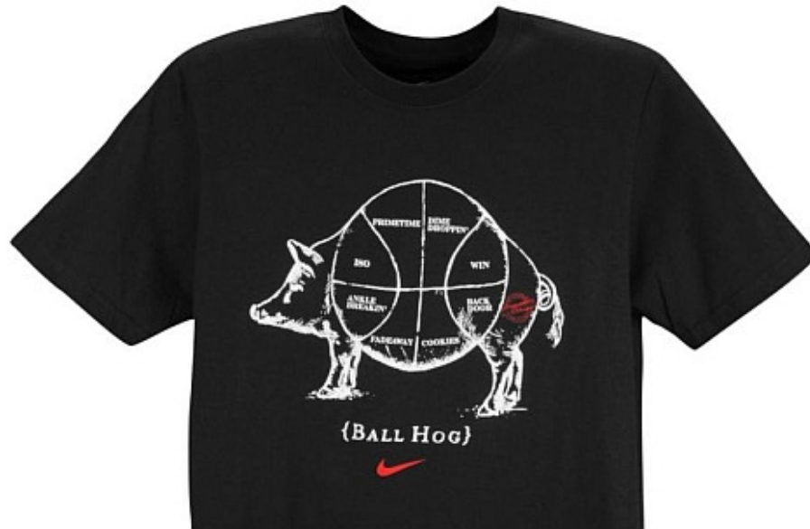
There are ball hog t-shirts...

My own view of the situation is that basketball is a team game composed of great individuals. There are times, especially with girls teams, where you have to encourage your better athletes toward somewhat "selfish" play. But is it really being selfish if a girl that has the ability -- the gift -- to score 25 points a night actually goes out and does so? Twenty-five points is a huge contribution. It dramatically increases the chances of her team winning the game. And that's the idea, right? So, a great individual performance seems, to me, to be cause for general celebration -- not condemnation -- from her teammates. And not every player has the skill or talent to score 25 points in a game. Most won't ever score 25 in a game over their entire playing career . If your team has such a girl, doesn't it make sense to use her? Doesn't it make sense to turn her loose on other teams? The more she is successful, the less strain there is on everyone else to come up big.