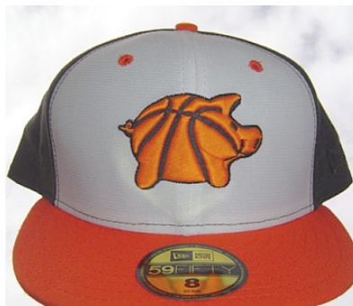
There are ball hog hats...

I'm hearing a lot anymore about ball hogs. As a non-parent, I'm alternately amused and saddened when I hear the term applied to youth players. Everyone has an agenda. I think the term ball hog springs out of jealousy. I'll bet you dollars to donuts that Michael Jordan, LeBron James, Kobe Bryant, Diana Taurasi, Cynthia Cooper and Lisa Leslie were all called ball hogs at one time or another when they played grade school and high school ball. Further, I'll also bet than none of those who leveled the charge made it to the pros, let alone to college ball (at any level). So, there is an element of sour grapes involved.